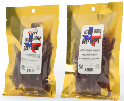
Beef jerky packages labeled with the ELF-20 shown with customer permission

In strict compliance with Good Manufacturing Practices (GMP) standards, the ELF-20 is made of 304 stainless steel and anodized aluminum, and carefully treated to guard against the effects of harsher environments. Additionally, its simplistic design enables quick fixes and easy adjustments. Given this durability and easy maintenance, the ELF-20 affords you a solid choice in labeling machine longevity.